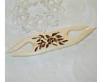
"Lady Hoare" tatted shuttle